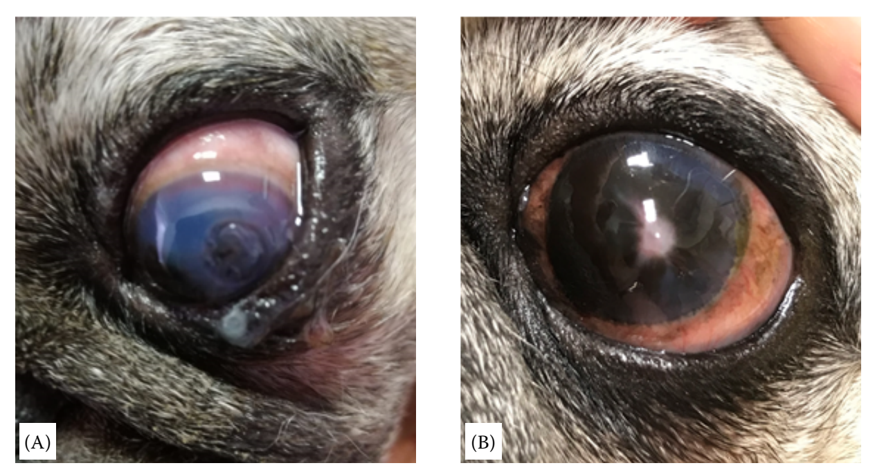
Figure 1. (A) Photograph of the cornea of a dog before undergoing PACK-CXL. The culture and sensitivity analysis revealed the presence of multi-resistant Staphylococcus spp. and Enterococcus spp. (B) At day 21, the corneal ulcer was filled with granulation tissue and the corneal fluorescein staining was negative. The corneal tissue surrounding the lesion was clear